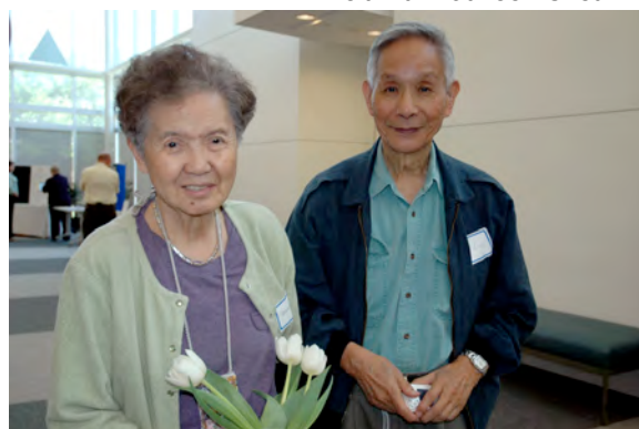
Symposium participants leave with tulip centerpiece prize